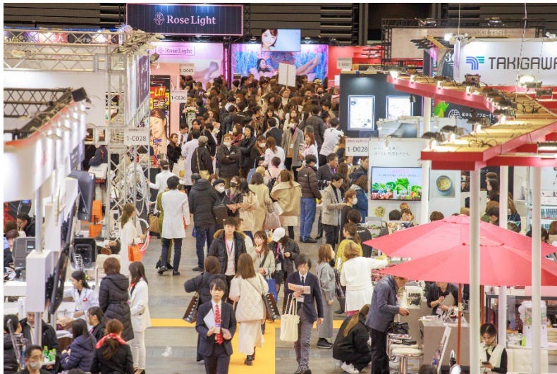
Beautyworld Japan Fukuoka 2024.

Including 91 first-time participants, 202 exhibitors showcased the latest information, products and services related to cosmetics, aesthetics, nail, hair and beauty equipment for salons to the trade audience in Fukuoka. The number of exhibitors was a record high, increasing 5% compared to the previous edition (2023: 192 exhibitors). As the fair keeps growing, it proves an ideal business platform for more and more beauty industry participants seeking new domestic partners, to expand their businesses, and to stay up-to-date with the latest trends and techniques.