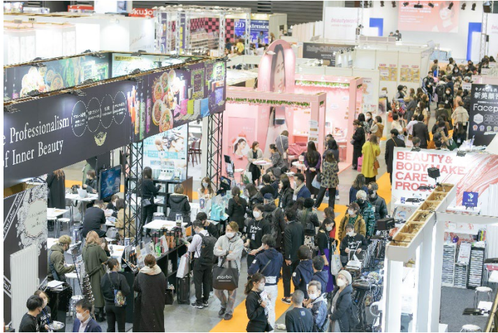
Beautyworld Japan Fukuoka 2023.

One of the primary reasons Beautyworld Japan Fukuoka attracts so many visitors is that it offers a wide range of seminars and demonstrations covering a variety of sectors and their corresponding trends. This edition, seven new speakers from hair, acupuncture, nail care and other beauty-related fields will make their debut and present their techniques and salon management expertise, providing valuable learning opportunities. A total of 25 seminars will be held across three stages during the three-day event.